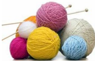
God's Busy Hands